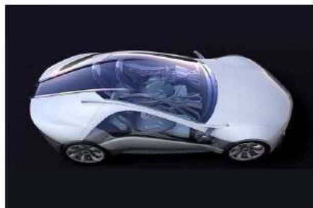
Bertone concept at the Geneva Auto Show